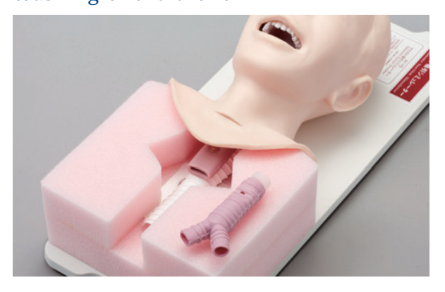
Washing of the oral cavity