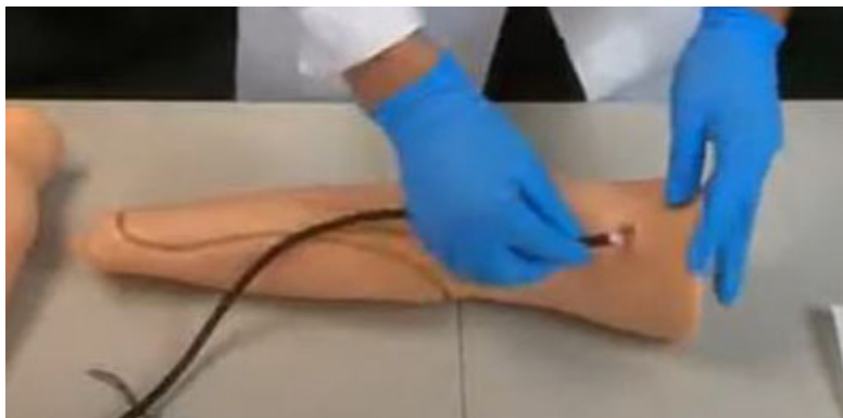
Inserting Tubing Into End Fitting