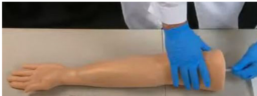
Reconnecting the Connector Tubes