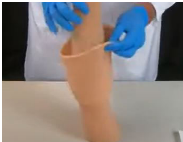
Pulling the Skin Off