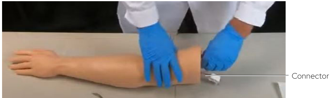
Removing the Connectors