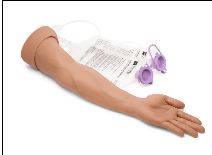
CAE Medicor Peripheral IV Arm

This model is intended as a platform for the practice of peripheral intravenous access and phlebotomy procedures.