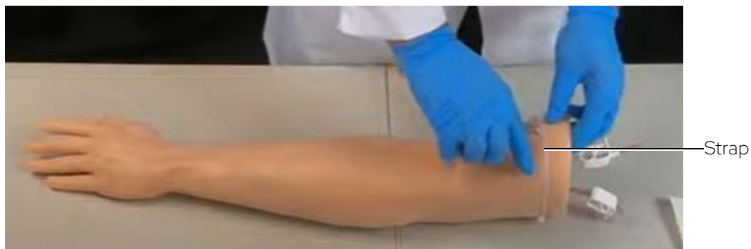
Cutting the Strap