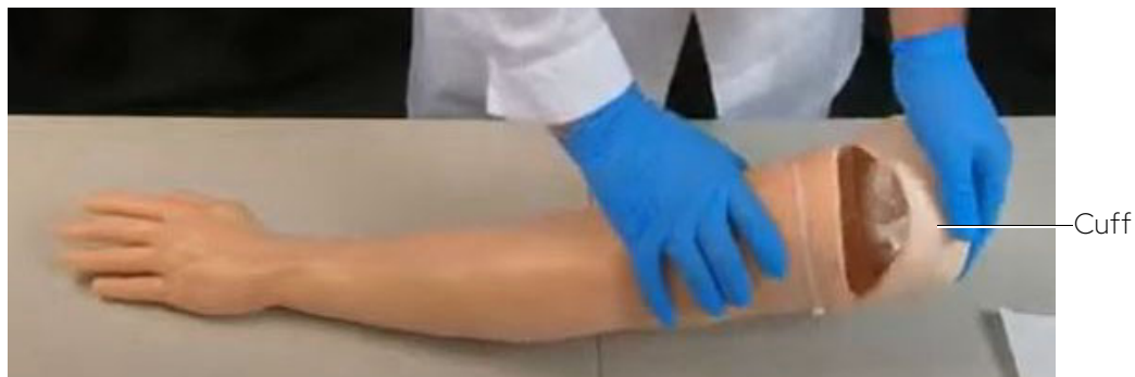
Removing the Cuff