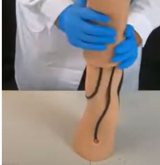
Rolling the Skin Down the Arm Base