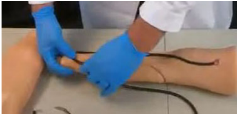
Pushing the Tubing Into Place