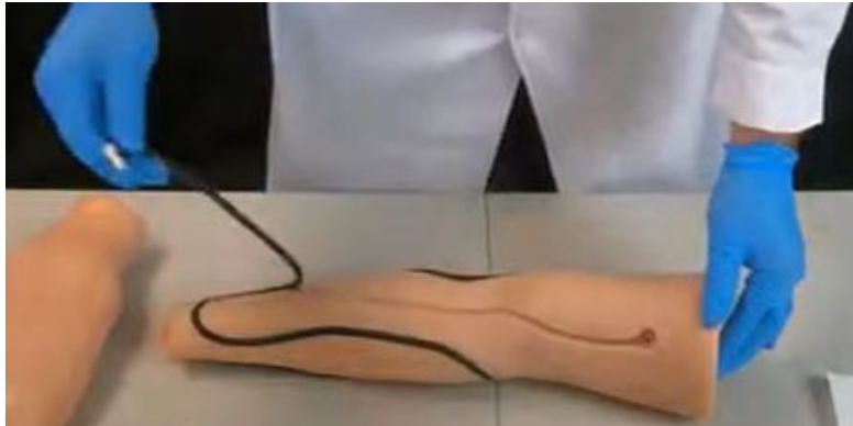
Removing the Tubing