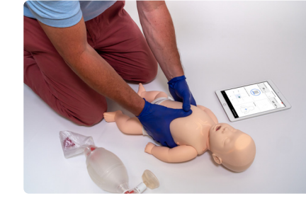
Correct chest compression technique (depth, rate, recoil and finger/thumb position) using lights on the manikin. Brayden Baby Pro also provides additional real-time feedback via Brayden Online.