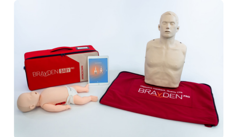
Brayden Baby Pro joins Brayden Pro (adult) working with Brayden Online Standard.