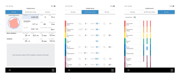
Comprehensive objective/numeric information is provided by Brayden Online and enables all relevant infant CPR parameters to be assessed.