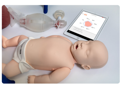
Easy to use and intuitive debrief of infant BLS performance provided via Brayden Online.