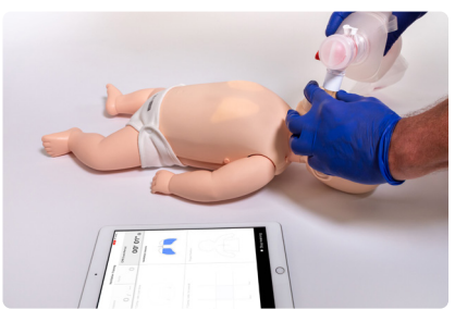
Provides unique intuitive real-time ventilation feedback using lights and sound. Brayden Baby Pro also provides additional real-time feedback via Brayden Online.