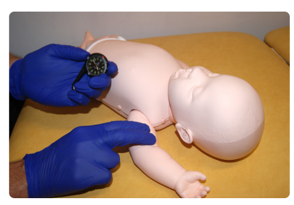
The brachial pulse function can be used for infant BLS scenarios when required.