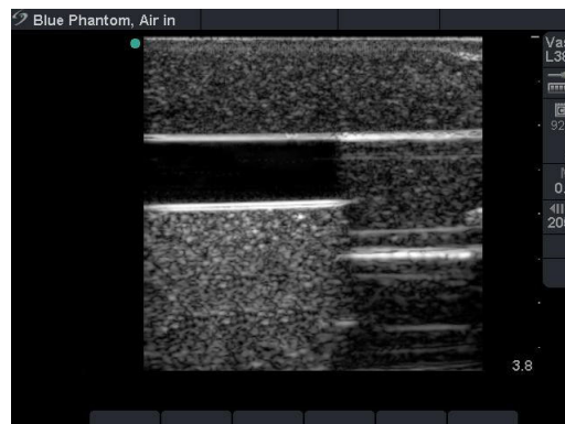
Low Fluid Level - Poor Imaging

A low fluid environment is identified by the inability to see the vessel during normal ultrasound imaging. This is due to the presence of air, which reflects all sound energy.