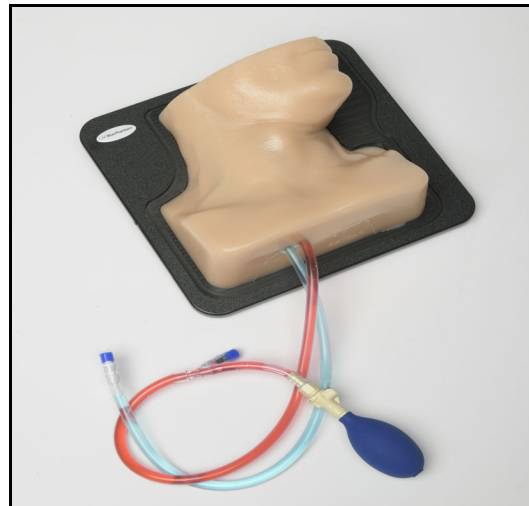
Ultrasound Training Model, opaque

These models are intended as platforms for the practice of central venous access procedures.