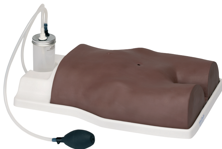
AR341-B Suprapubic Catheterisation Model, Black