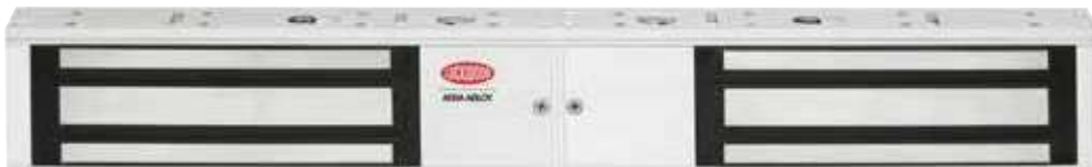
Z8 Double Electromagnetic Lock - Monitored