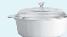
3.25L Round Covered Casserole

All information provided is true and correct at the date of publication. Products and designs featured subject to availability. Contact us to find out more.