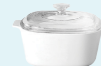
1.5L Covered Casserole