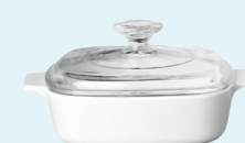
1L Covered Casserole