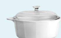
2.25L Round Covered Casserole