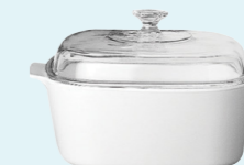
5L Covered Casserole