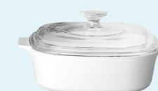
2L Covered Casserole