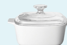
3L Covered Casserole