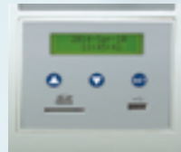
Data recorder for FA-R (SD card, USB port)