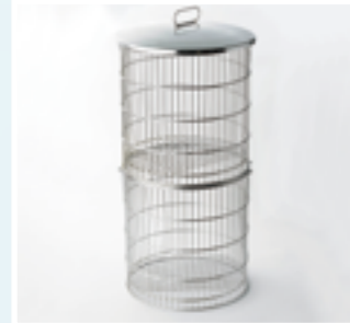
Double Baskets n/a for smaller upright models