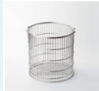
Single Basket 16/50L