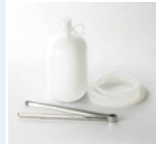
Water Bottle, Silicone Tube, Clips Stainless Steel Tube also available