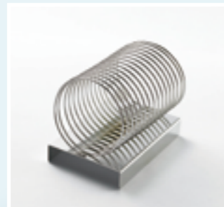
Pouch Holder 97(w) x 122 (h) x 148 (d)