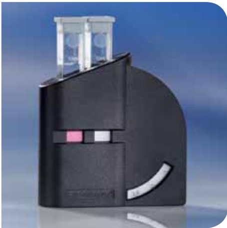
Front view of the CHECKIT®Comparator with cells