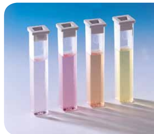
Plastic cells, volume 10 ml

Material Safety Data Sheets: www.lovibond.com