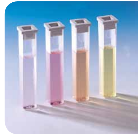
Plastic cells, frosted on two sides, volume 10 ml, path length 13.5 mm, with lid