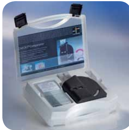
Test Kit complete in case