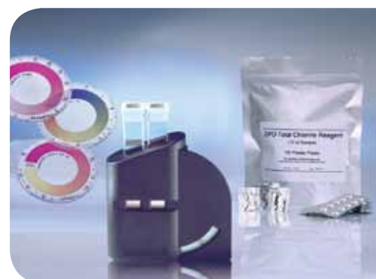
CHECKIT® Comparator with powder reagent / tablets

Material Safety Data Sheets: www.lovibond.com