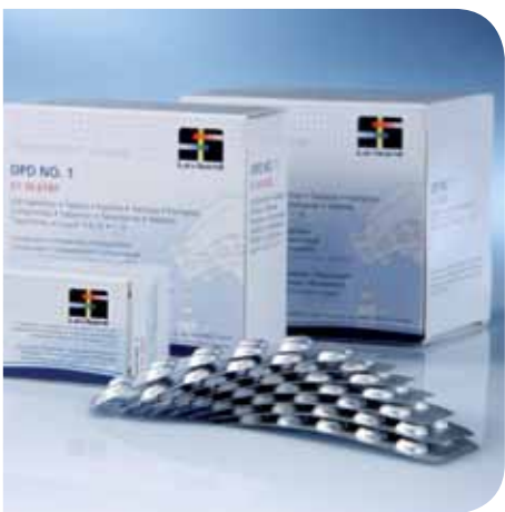
Tablet reagents in foil blister strip