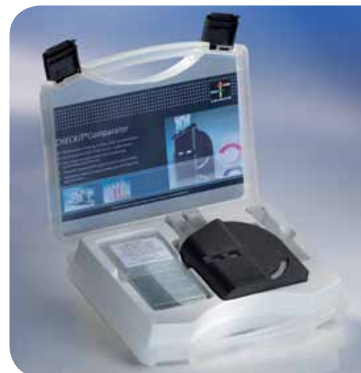
Test Kit complete in case

Material Safety Data Sheets: www.lovibond.com