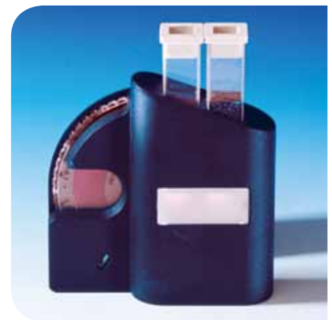
Rear view of the CHECKIT®Comparator with disc, diffuser and cells