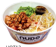
HOT12 Salmon Teriyaki with Rice