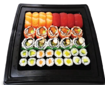
PAR03 34pc £27.00

4pc Salmon Nigiri 4pc Seared Salmon Nigiri 4pc Tuna Nigiri 4pc Cooked Prawn Nigiri 4pc Egg Tamago 2pc Grilled Eel Nigiri 2pc Beansheet Nigiri Soy Sauce & Wasabi cr, eg, fi, gl, so