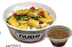
HOT02 Vegy Japanese Curry with Rice