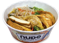
HOT06 Yakisoba with Tofu and Vegy Gyoza