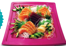
PAR04 20pc £31.00

Add your favourite food & drink products to complete the package