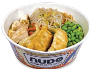
HOT07 Yakisoba with Chicken and Vegy Gyoza