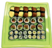
PAR05 34pc £24.00

View the full product range NUDOSUSHIBOX.COM