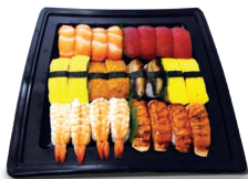
PAR02 24pc £27.00

info@nudosushibox.com www.NudoSushiBox.com