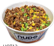
HOT13 Shredded Beef and Sweetcorn with Rice