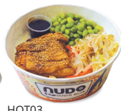
HOT03 Chicken Teriyaki Leg with Rice