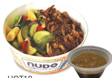
HOT10 Aromatic Shredded Duck Japanese Curry with Rice