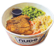
HOT03 Chicken Teriyaki Leg with Rice gl, se, so