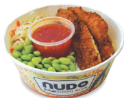
HOT05 Sweet Chilli Chicken Katsu with Rice eg, gl, se, so 🌶️