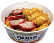
HOT15 Yakisoba with Char Siu Pork and Vegy Gyoza gl, se, so