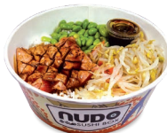
HOT12 Saluon Teriyaki with Rice may contain bones fi, gl, se, so