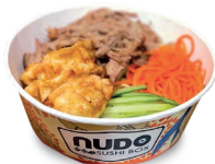
HOT27 Aromatic Duck and Vegy Gyoza Noodles gl, so may contain bones