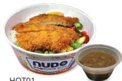
HOT01 Chicken Japanese Curry with Rice eg, gl, so