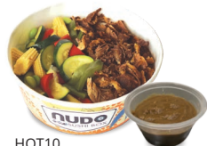
HOT10 Aromatic Shredded Duck Japanese Curry with Rice gl, so may contain bones