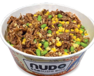
HOT13 Shredded Beef and Sweetcorn with Rice gl, so