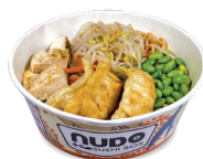
HOT07 Yakisoba with Chicken and Vegy Gyoza gl, se, so ♥