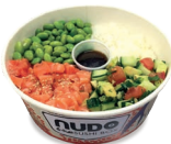
DON03 Poke Bowl

Seared Salmon & Tuna Sashimi eg, fi, gl, mu, se, so ♥