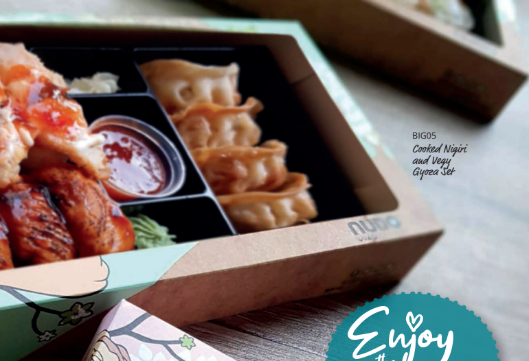
BIG05 Cooked Nigiri and Vegy Gyoza Set