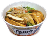
HOT06 Yakisoba with Tofu and Vegy Gyoza VE, gl, se, so ♥