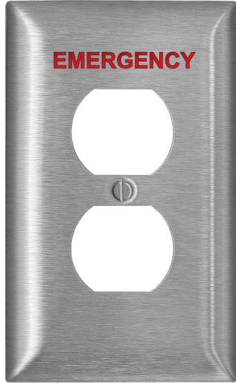
Example Shown: Single Gang Duplex Receptacle