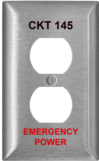
Example Shown: Single Gang Duplex Receptacle