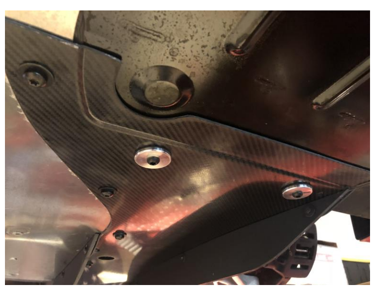
Diffuser Hard Mount Installed (Shown Not Anodized)

DSE-VP-EA-012: ACR Extreme Diffuser Leading Edge Hard Mount / Lock (Set of 4).