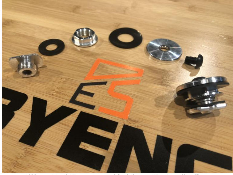
Diffuser Hard Mount Assembly (Shown Not Anodized)