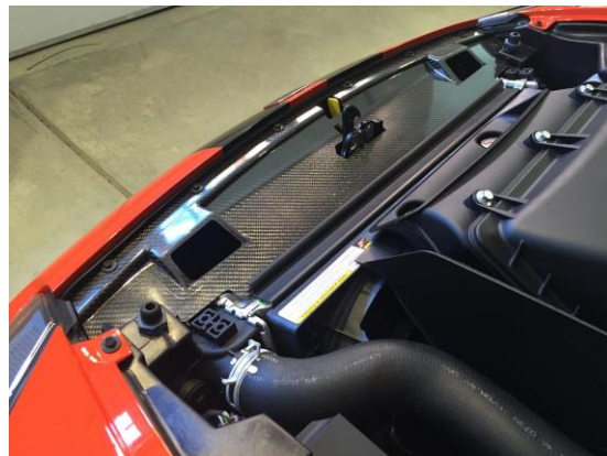
"Ram Air" Closeout Panel Installed

The result is more efficiently used air - lower coolant temperatures when running on the track, and/or more airflow into the airbox depending on the version of panel and the configuration used.