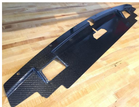
DSEVP-CP-002 "Ram Air" Closeout Panel

The closeout panel is constructed of hand laid carbon fiber which is cured in an autoclave. The panels are 100% USA made by motorsport professionals.