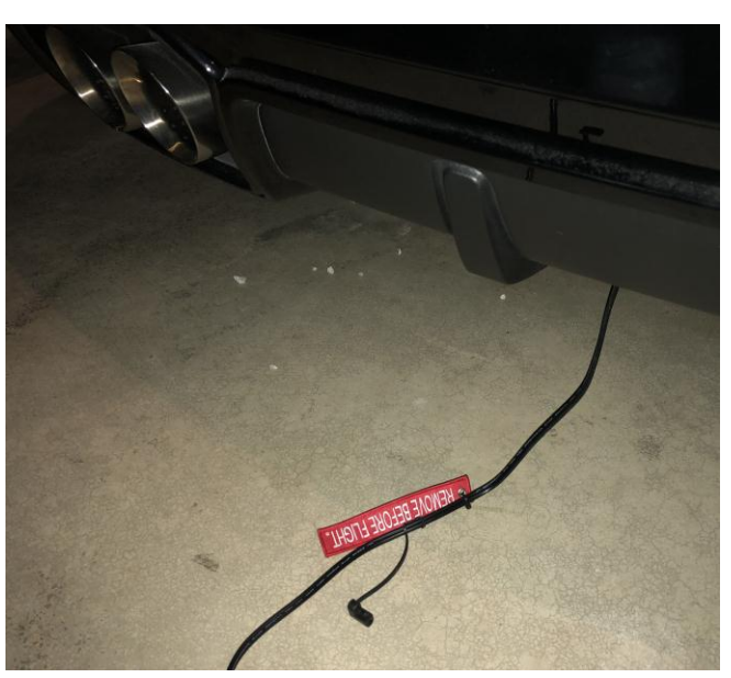
Charging the Battery Through the DSE Quick Access Charging Harness

See photos on the next page for wiring layout guide.