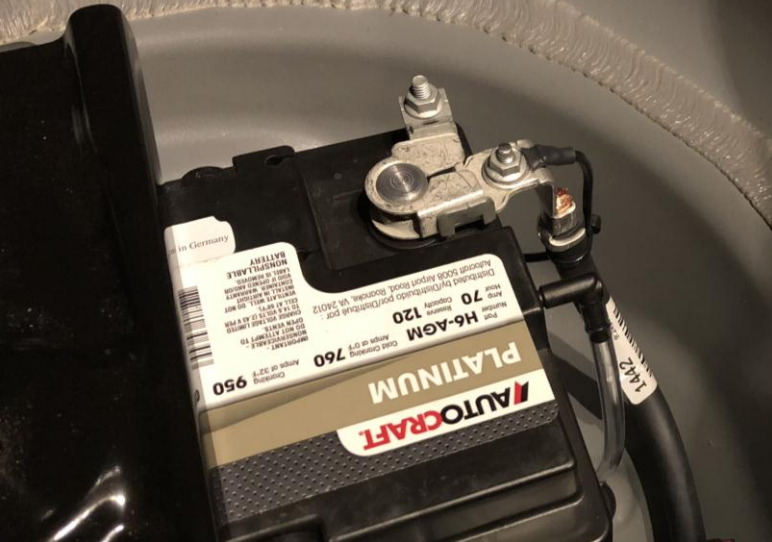
Rear View of Battery and Recommended Strain Relief for Ground Wire