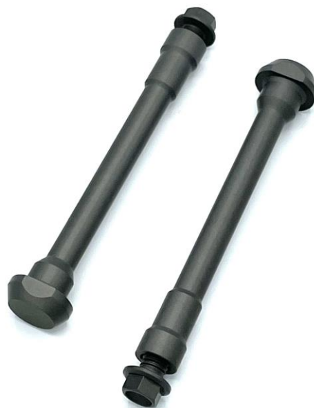
Brake Caliper Cross Bolt Set

Seller disclaims any warranty express or implied with respect to the parts sold hereby whether as to merchantability, fitness for particular purpose, or any other matter.