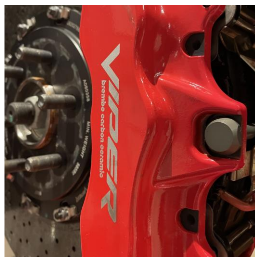
Installation of the Front Brake Caliper Cross Bolt