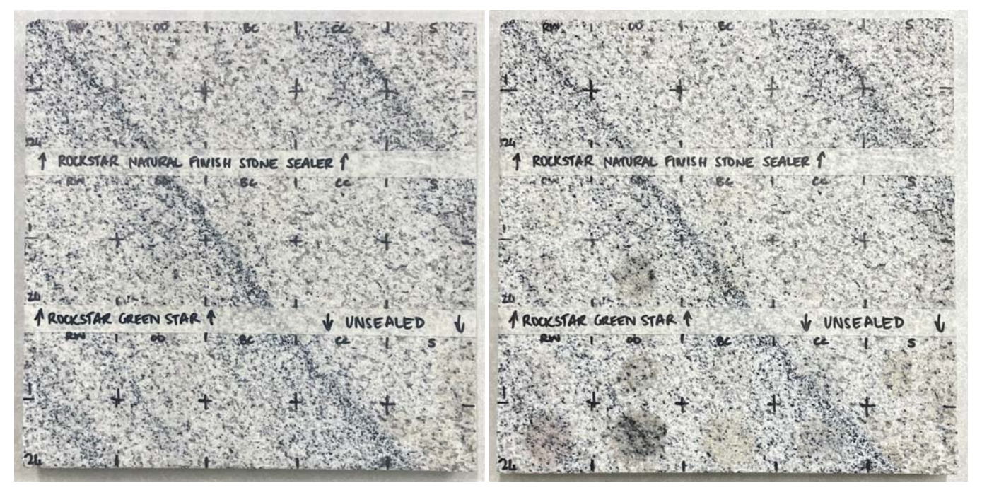
Plate 1: Appearance of samples of White Granite before application of staining agents (left) and after removal of staining agents (right).

Top; Rockstar Natural Finish Stone Sealer, Middle; Rockstar Green Star, Bottom; Unsealed.