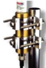
Figure 2: FM2 Mounting Kit (sold separately)