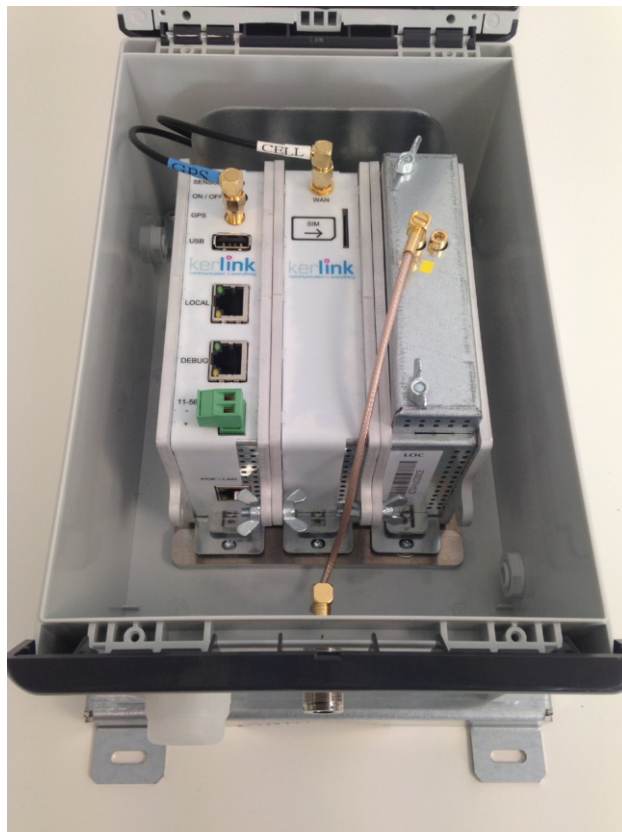
Wirnet™ iBTS Compact