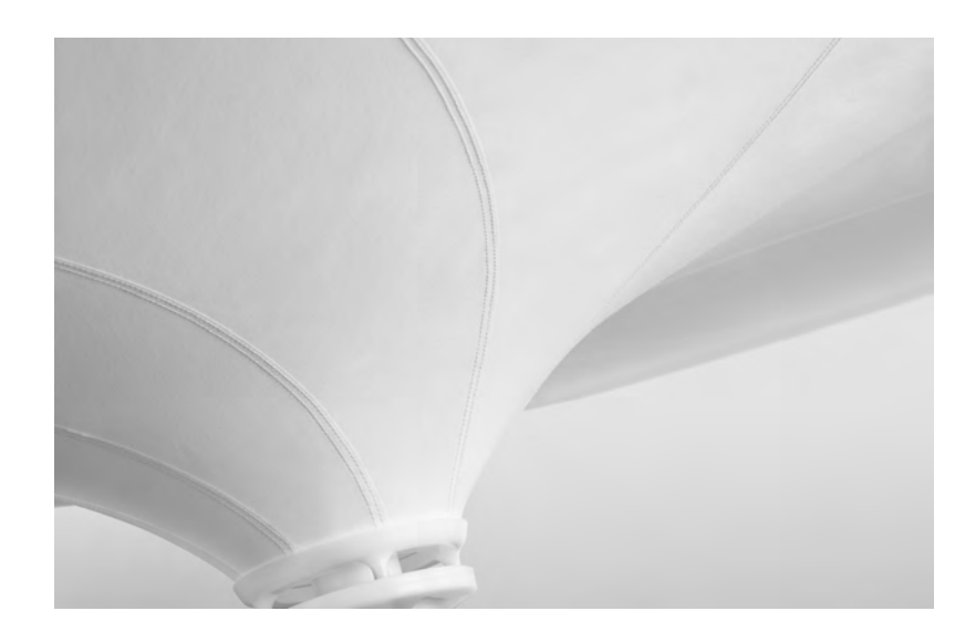
Remains stable in windy weather