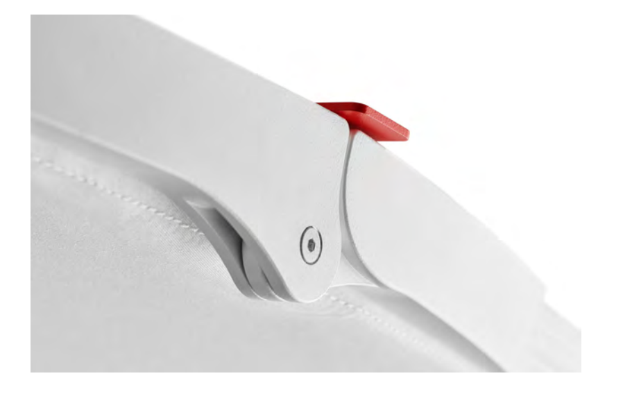
Highest quality materials ensure outstanding functionality and durability