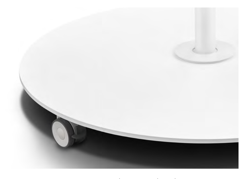
Easy to move and secure in place