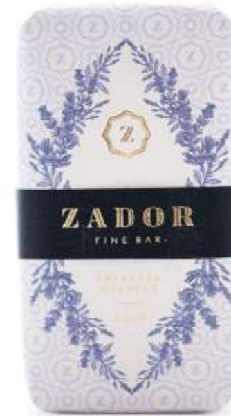
Fig-pear as perfume ingredient offers lasting experience among the creamy, soft scents. It is spicy and fruity, bringing up fragrance of paradise, with a bit of fresh, greenish overtone.

Fig thought to be also fruit of sensuality and pear with its sourer fragrance perfectly complete each other, recalling the hotness of summer afternoons to our mind when taking a deep sniff of the aromas released during bathing.