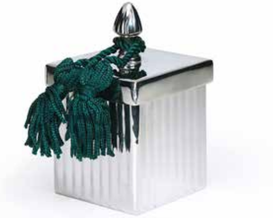
Large Square Polished, 1 Wick Candle