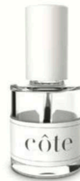
PROTECTIVE BASE & TOP