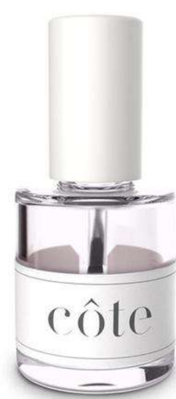
GROWTH WITH GARLIC BASE