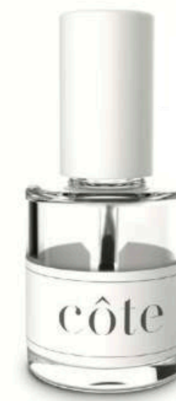
QUICK DRY TOP