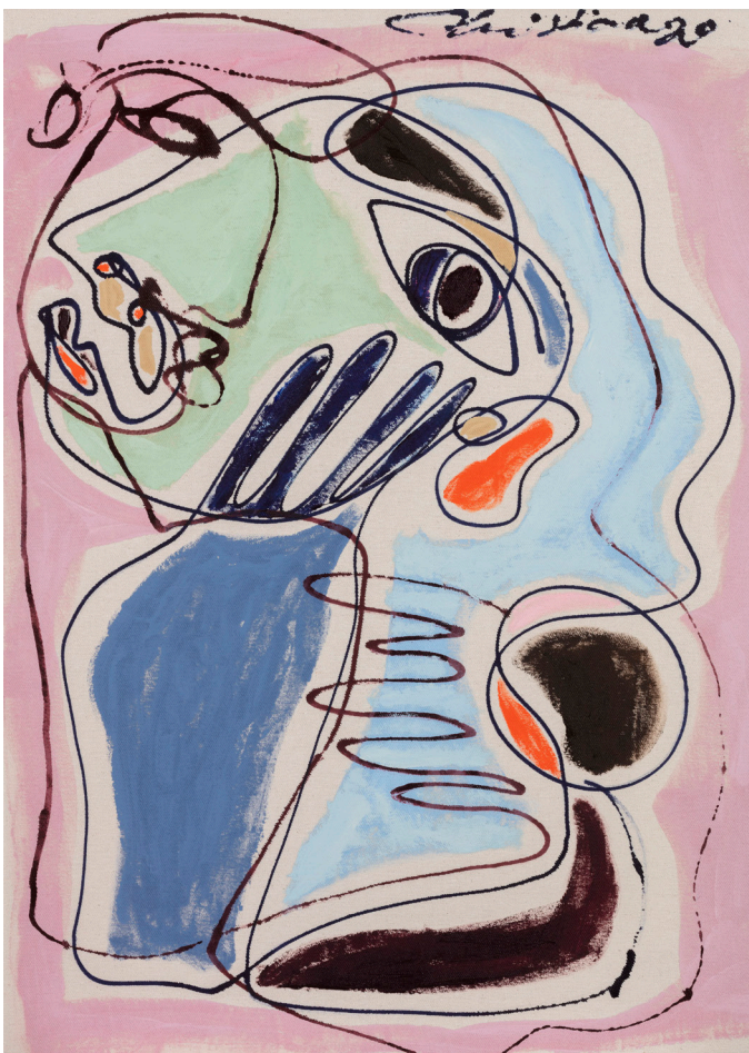
Ecstasy, 2020 Acrylic on raw cotton 98 x 75 cm £ 7,080.00