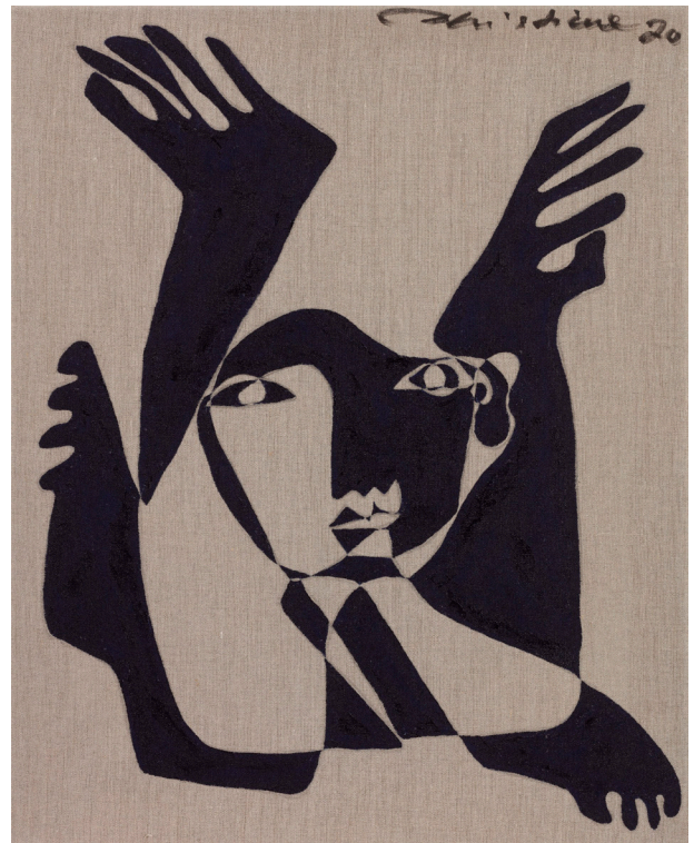
Wild escape, 2020 Acrylic on raw linen 73,5 x 62 cm £ 5,520.00