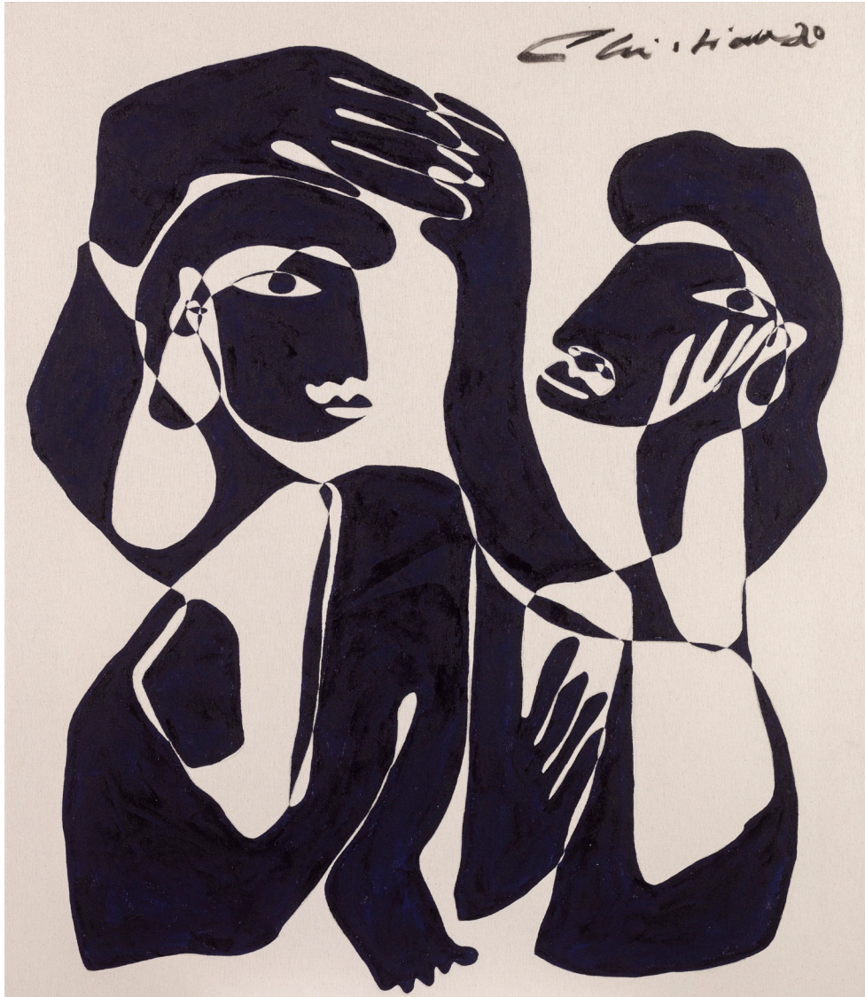
The Rhythm, 2020 Acrylic on raw cotton 130,5 x 114,5 cm £ 10,200.00