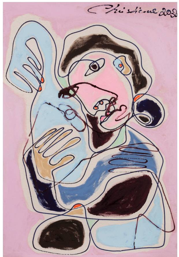
Vogue, 2020 Acrylic on raw cotton 116 x 92 cm £ 9,000.00