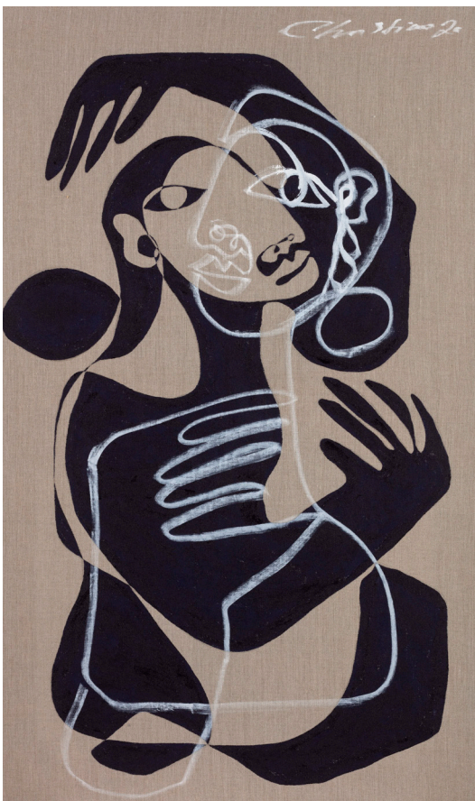
Ballet, 2020 Acrylic on raw linen 126,5 x 83 cm £ 8,640.00