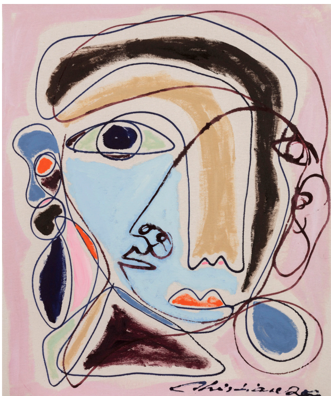
The first dance, 2020 Acrylic on raw cotton 95 x 82,5 cm £ 6,600.00