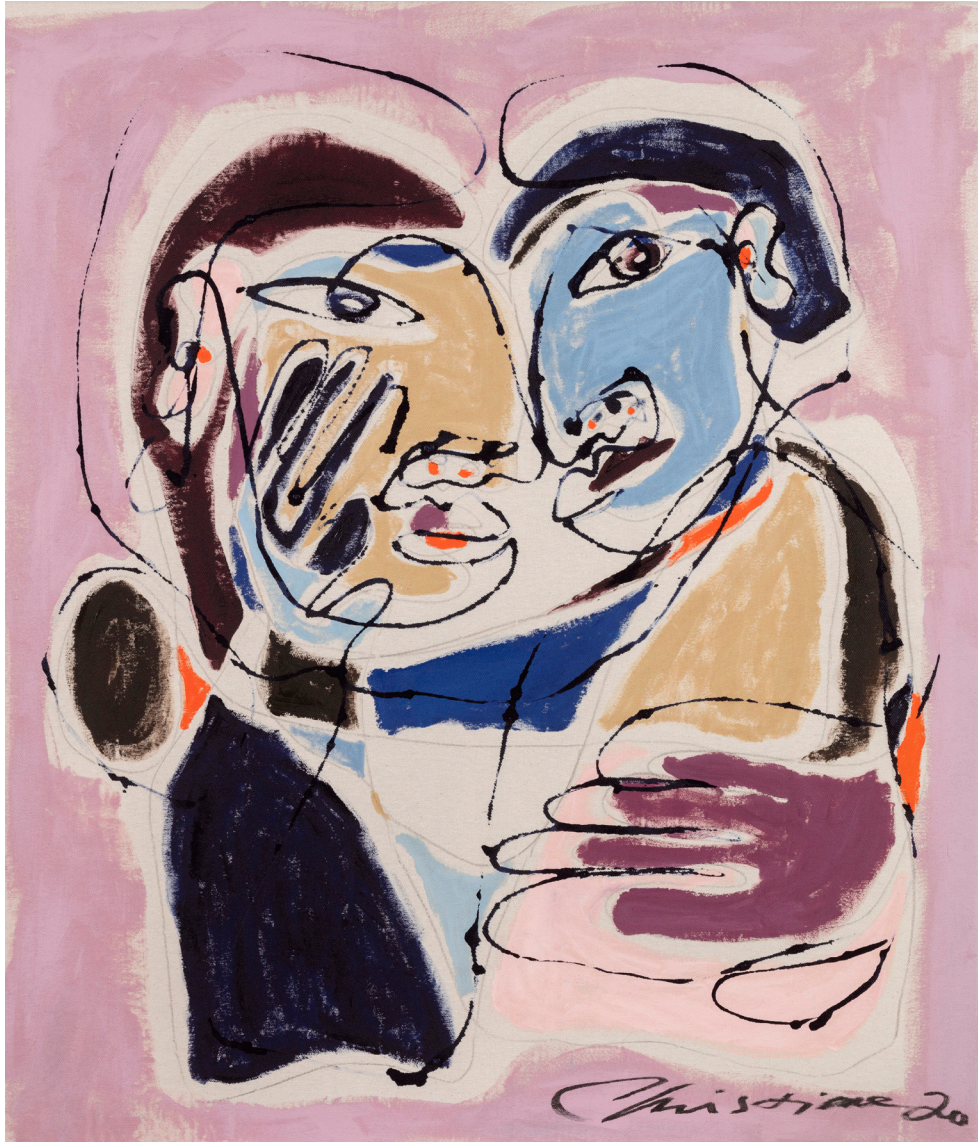
Come closer, 2020 Acrylic on raw cotton 123,5 x 107,5 cm £ 10,200.00