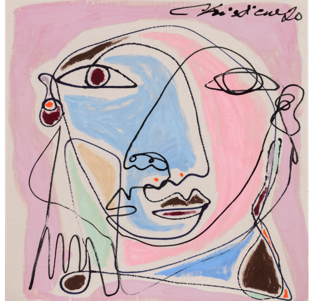
Take the lead, 2020 Acrylic on raw cotton 80 x 75 cm £ 5,700.00