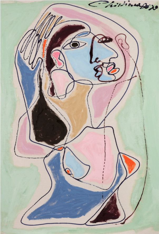
Theatre, 2020 Acrylic on raw cotton 120,5 x 87 cm £ 9,000.00