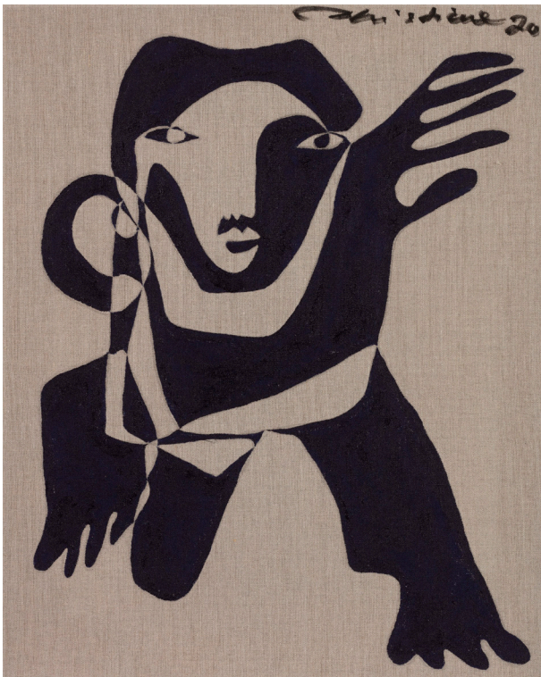
The Vibe, 2020 Acrylic on raw linen 73,5 x 62 cm £ 5,520.00