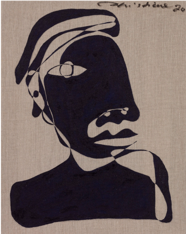
Man Looking at woman, 2020 Acrylic on raw linen 71 x 60 cm £ 4,680.00