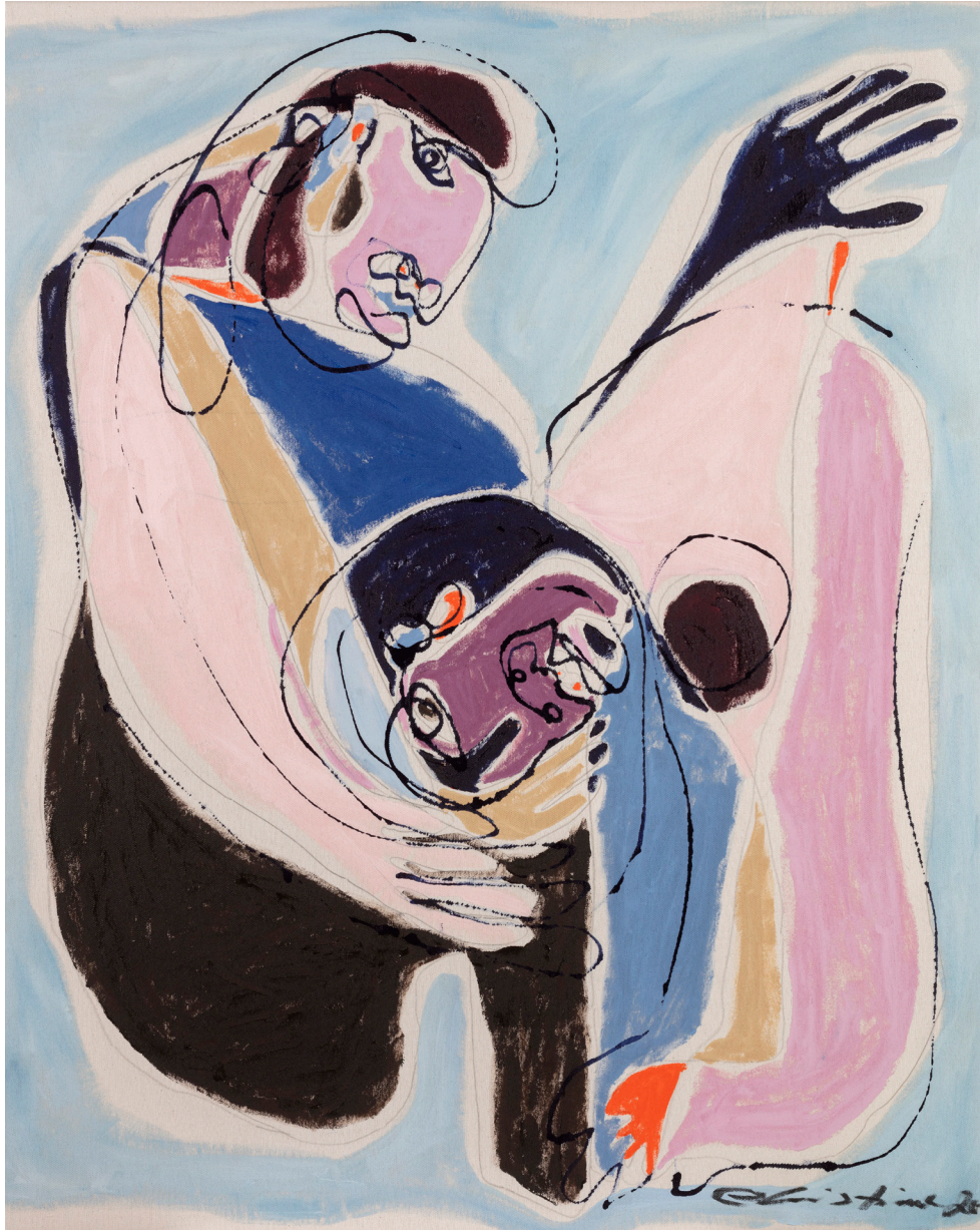
Dance with me?, 2020 Acrylic on raw cotton 129,5 x 106,5 cm £ 10,200.00