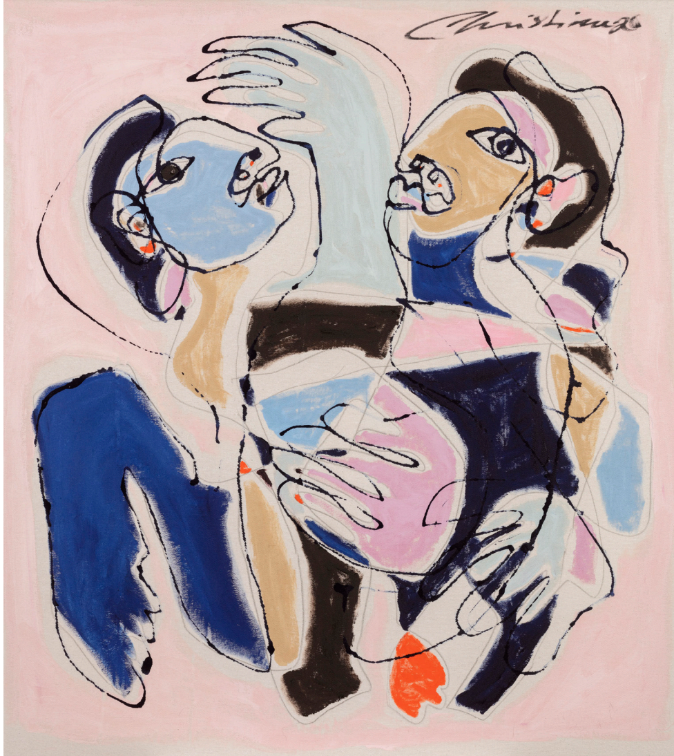
Jazz, 2020 Acrylic on raw cotton 124,5 x 112,5 cm £ 10,200.00