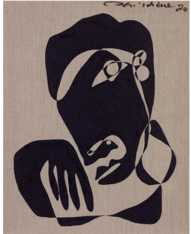
Woman flirting, 2020 Acrylic on raw linen 71 x 60 cm £ 4,680.00