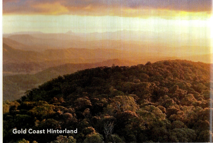
Gold Coast Hinterland