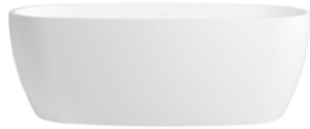
● FREE-STANDING BATHTUB BANERA FREE-STANDING

Deep ha superado con éxito exigentes tests de durabilidad y resistencia para asegurar una larga vida al producto.