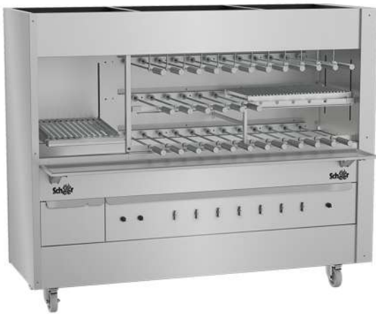
EXAMPLE PHOTO IG 550S WITH 35 SKEWERS, 3 GALLERIES WITH SIDE LIFTER GRILL + LIFT GRILL 500MM

SCHEER CHURRASQUEIRAS RUA ROQUE CALLEGE, 133 | CEP 95041-440 | UNIVERSITÁRIO | CAXIAS DO SUL | RS | BRAZIL