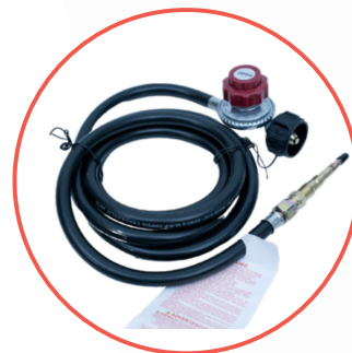
Regulator & Hose