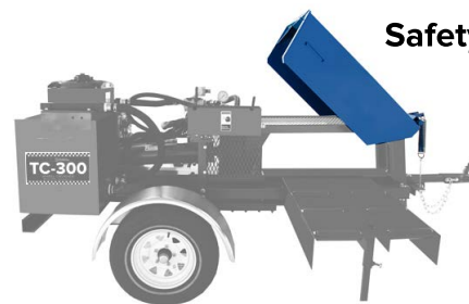
Safety Cover Kit #6171