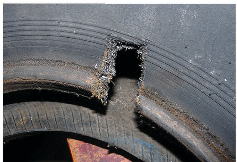
Detail of Notched Tire