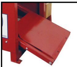
Wheel Lift #WLA-STE-M