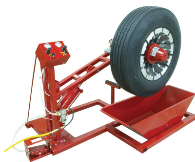
TI-96 Tire Inspector