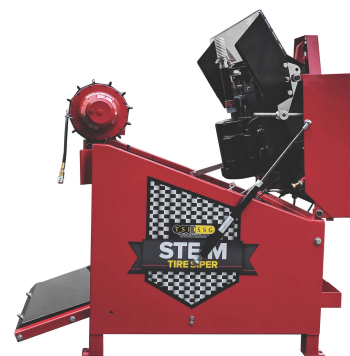
STE-M Tire Inspector