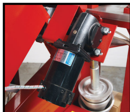
Automated Cycle Feed #6005