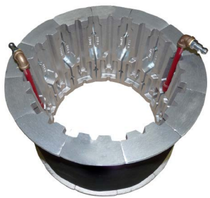
9.410 14" - 17" x 7 1/8"