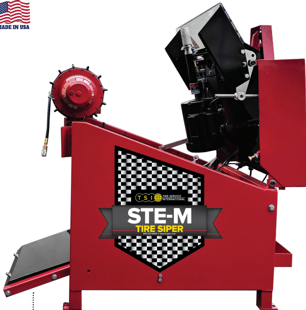
STE-M shown with optional WLA-STE-M Wheel Lift