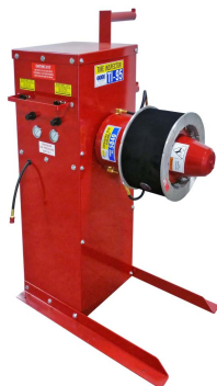
TI-95 Tire Inspector

Expandable rims are available for the following products