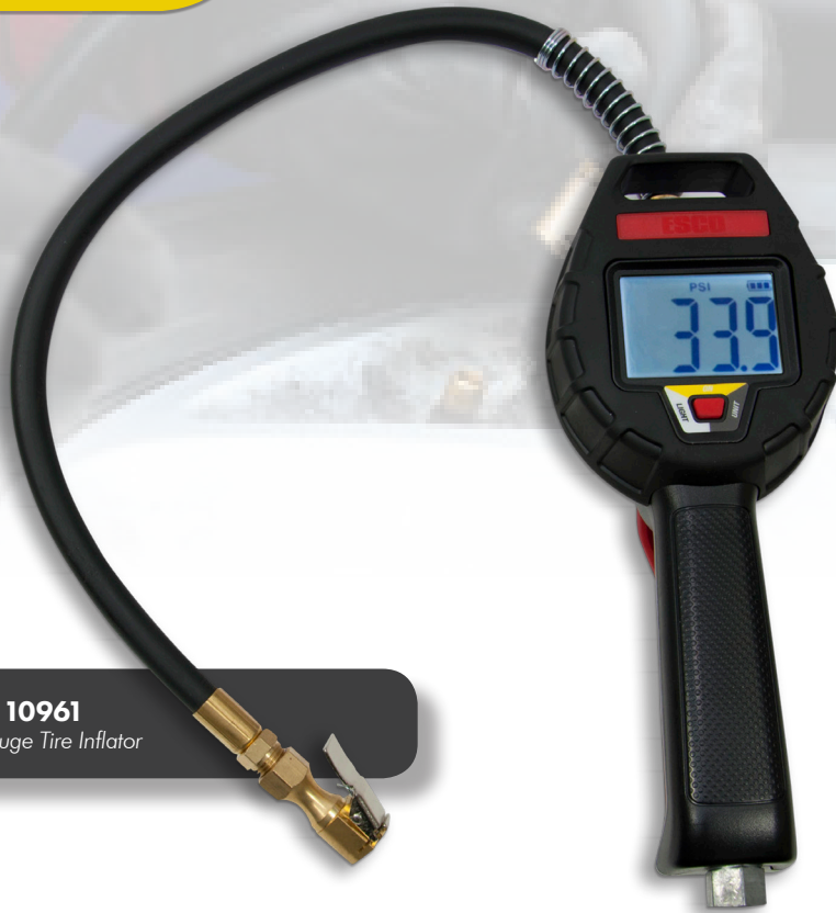
MODEL 10961 Digital Gauge Tire Inflator