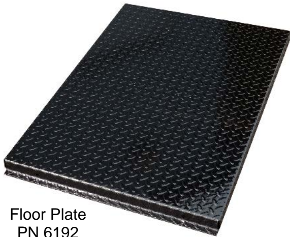
Floor Plate PN 6192