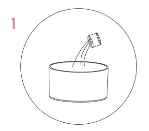
Add water to a container (bowl, cup, whatever you prefer!)