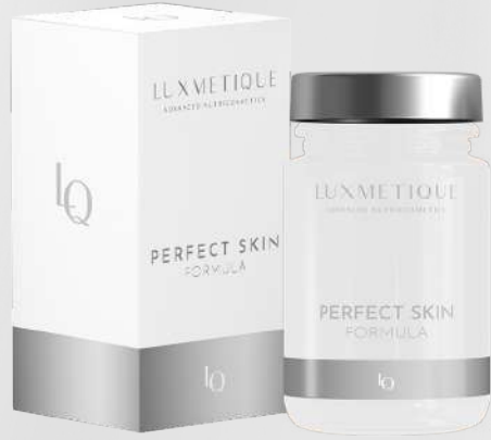
PERFECT SKIN FORMULA