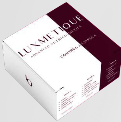
CONTROL 3 FORMULA