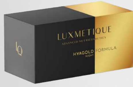
HYAGOLD NIGHT FORMULA