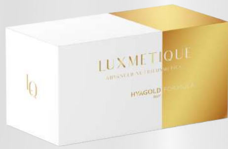
HYAGOLD DAY FORMULA