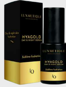
HYAGOLD DAY & NIGHT SERUM