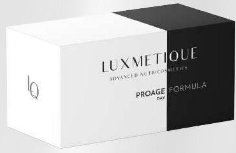
PROAGE DAY FORMULA