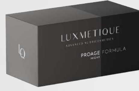
PROAGE NIGHT FORMULA