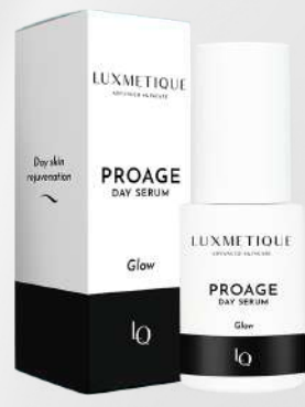
PROAGE DAY SERUM