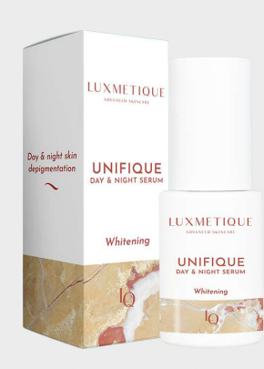
UNIFIQUE DAY & NIGHT SERUM