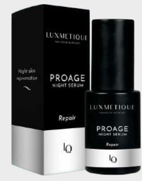
PROAGE NIGHT SERUM