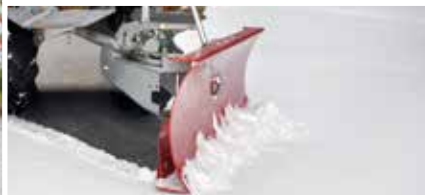
Snow Plough 1600mm