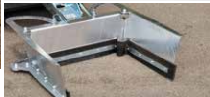
Pushing Shield 800-1600mm