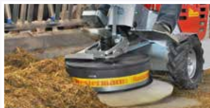
Radial Poly Brush 900mm