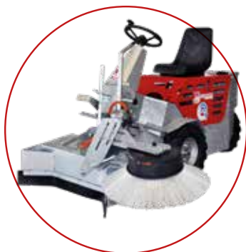
CM2 Electric Ride-On (Page 24)

Block paving / tarmac / concrete / tennis courts (tarmac) / rubber play surfaces / stone paving slabs