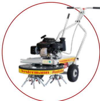
WKB 660 Weed Ripper (Page 12)

Outdoors: all hard surfaces / stables Indoors: warehouse hard floors / concrete