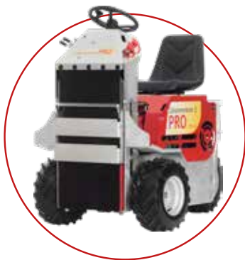
CM2 Petrol Ride-Ons (Page 14 - 23)