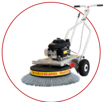
WR 870 Moss Brush (Page 6)