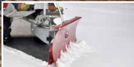
Snow Plough 1600mm