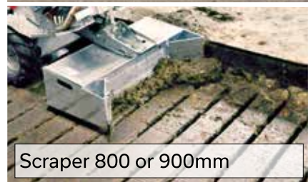
Scraper 800 or 900mm