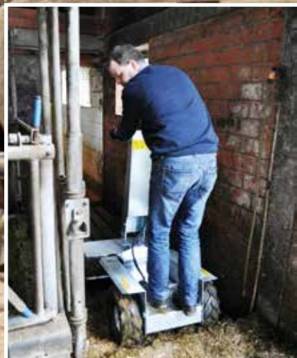
Elektro - Stand on