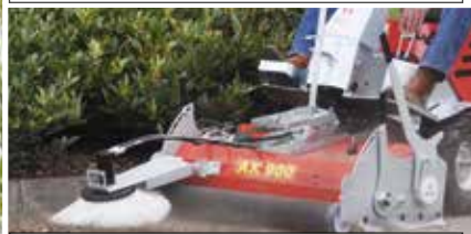
Axial Sweeper + Collection 900mm