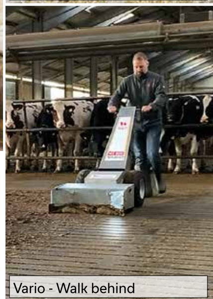
Vario - Walk behind