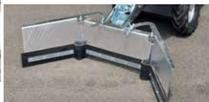
Pushing Shield 800-1600mm