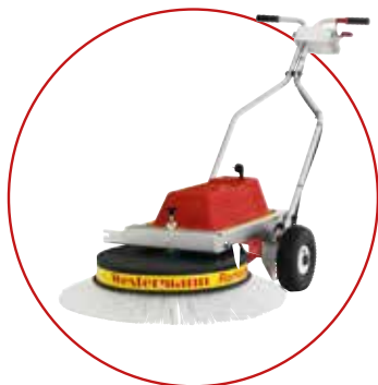
WR 870 Battery Sweeper (Page 8)

Block paving / tarmac / concrete / tarmac tennis courts / rubber play surfaces / stone paving slabs