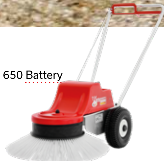
WR 650 Battery