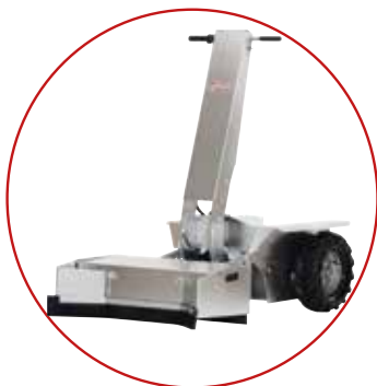
CMA and WS Scrapers (Page 26)

Outdoors: all hard surfaces / stables Indoors: warehouse hard floors / concrete