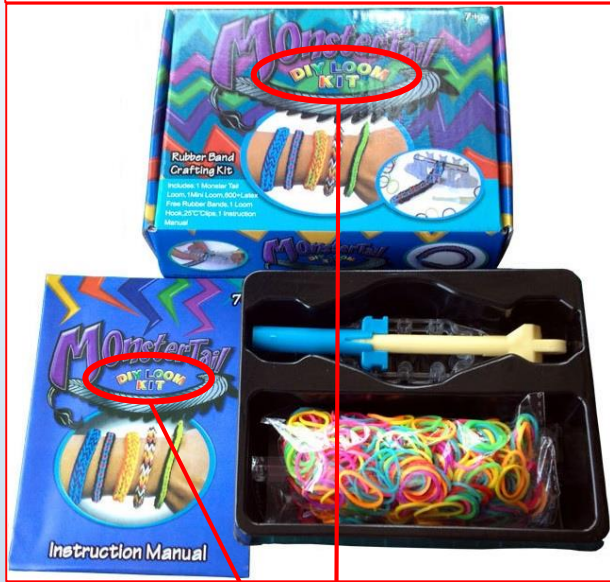
Non-Rainbow Loom branding