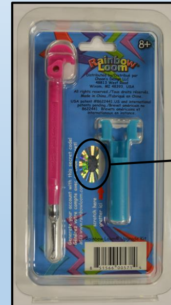
Authentic (reverse side)

Secret Code (revealed after scratching off)