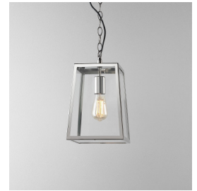
CODE: 1306014 FINISH: POLISHED NICKEL

THIS PRODUCT IS NOT SUITABLE FOR INSTALLATION WITHIN FIVE MILES OF THE COAST. FOR THESE ENVIRONMENTS, PLEASE FILTER PRODUCTS ON THE ASTRO WEBSITE BY 'COASTAL'.