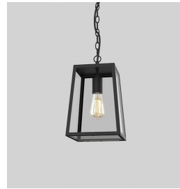
CODE: 1306013 FINISH: TEXTURED BLACK