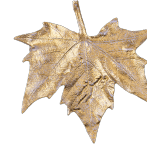
Gold/White Patina (FO/PB)