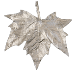
Silver/White Patina (FP/PB)