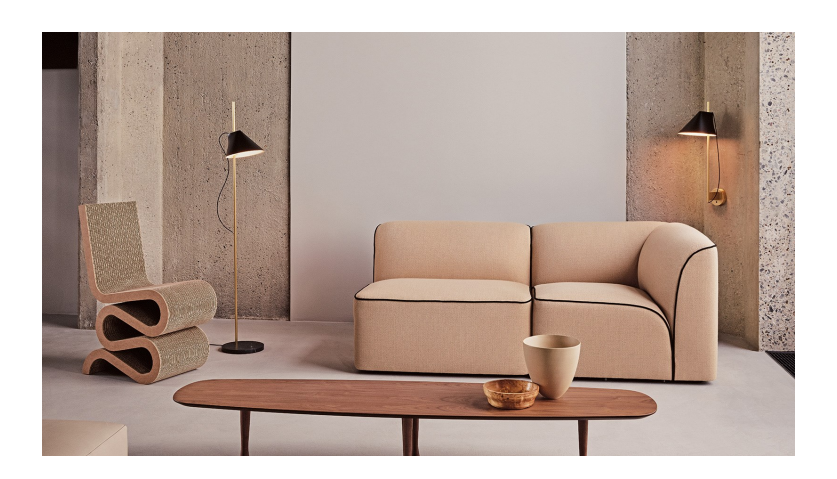
Set location - The Silo