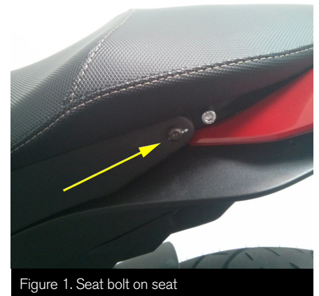
Figure 1. Seat bolt on seat

On MY15 and later motorcycles remove the seat bolts using a T45 Torx wrench and retain for re-use. You won't need the extra M8x50 screws