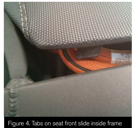
Figure 4. Tabs on seat front slide inside frame

On MY15 or later motorcycles, reinstall the seat using the original seat bolts and a T45 Torx wrench. Again, be sure the seat tabs slide properly inside the frame and below the tank. Torque the seat bolts to 16 ft-lbs.