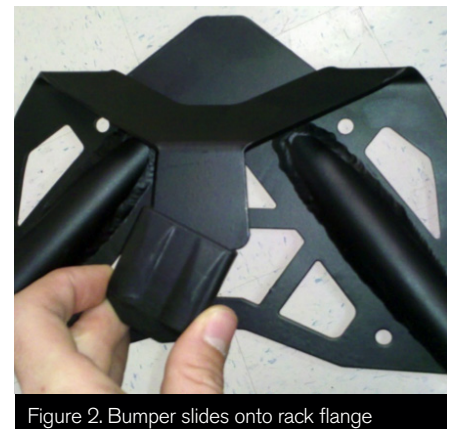
Figure 2. Bumper slides onto rack flange