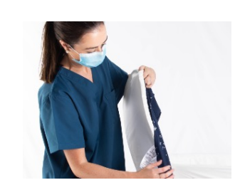
Mattress with Cotton Sheet