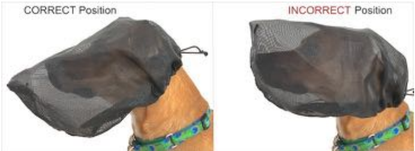
Dog is wearing the same Field Guard in both pictures