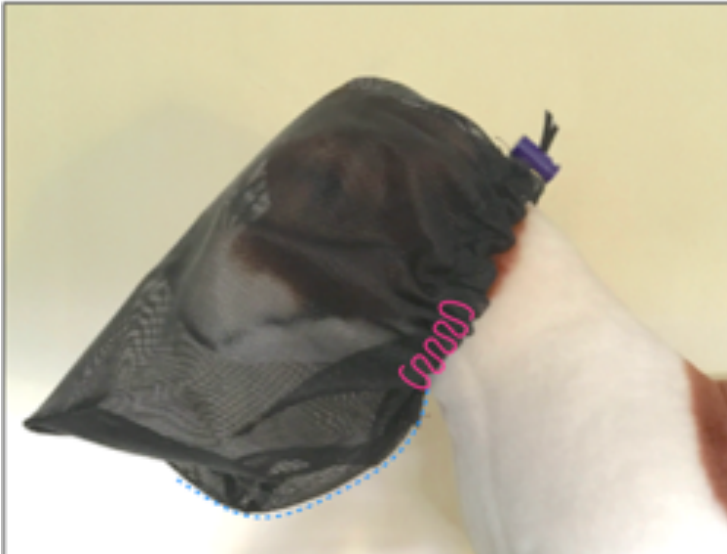
gathers pushed down under throat