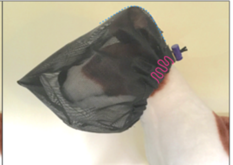
gathers pushed up to back of neck