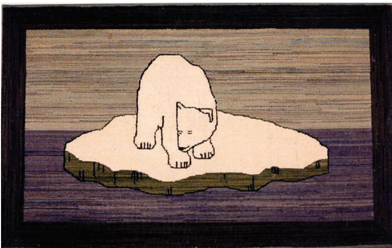
Grenfell Mat (above)

Then the 20th century brought new innovations: William Grenfell discovered that 'laddered' (snagged) silk-stockings made distinctive and greatly valued rugs, and the Multicolores folks in Guatemala still make their magnificent designs with T-shirts. Rug hooking is such a versatile craft, throughout time, people have employed whatever materials that they had available to make beautiful, durable, heirloom quality rugs. Fortunately for us today, all of those materials are easily found. It's just a matter of finding which material works best for your project.