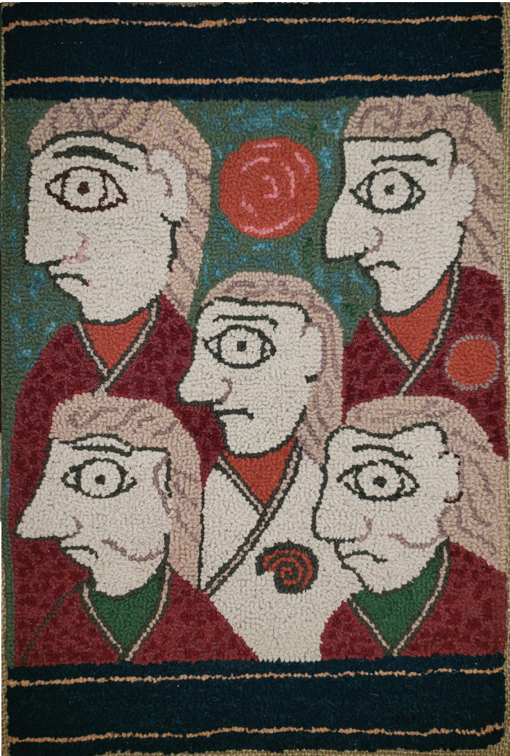
Book of Kells, 20"x13.5", hooked with T-shirts (right)

T-shirt rugs are tough and durable, but you can wash them in the washing machine? If you hook your rug on pre-washed linen or cotton, then yes, they wash very well.