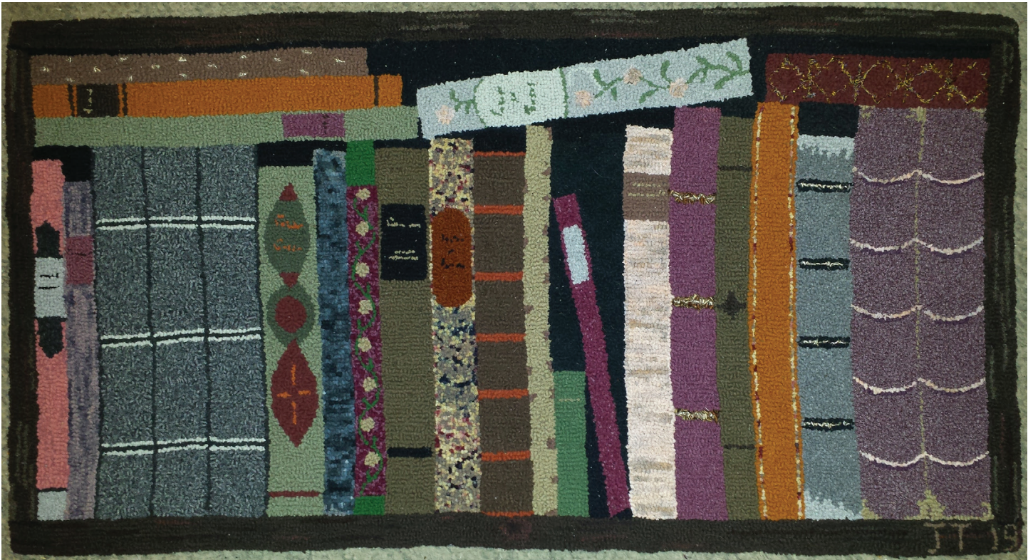
Old Books, 17"x32", hooked with T-shirts