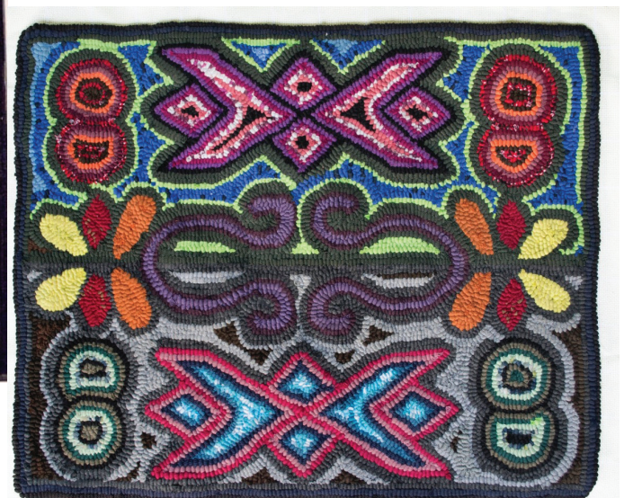
Multicolores Rug (right)