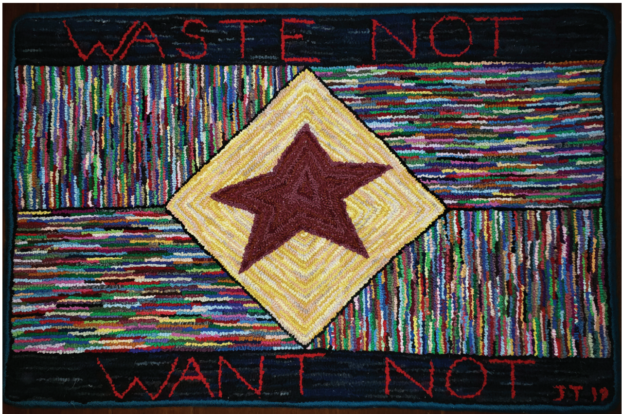
Waste Not Want Not, 31"x20", T-shirt strips on linen, washed.

As for how to hook with T-shirt strips, follow the same steps that you use for hooking with yarn, except for one thing: Every once in a while, I will come across a T-shirt that is more textured, and when I pull down on a loop, I find that it drags itself down a little in the back (making a little loop in back). If that happens, I just leave my hook in the loop as I pull it down to the desired height. I don't give upward pressure with the hook, just having it there provides enough resistance so it won't drag down in back.