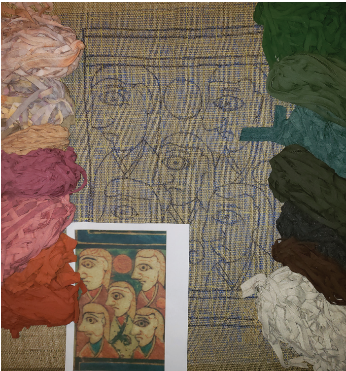
T-shirt strips for Book of Kells (above)