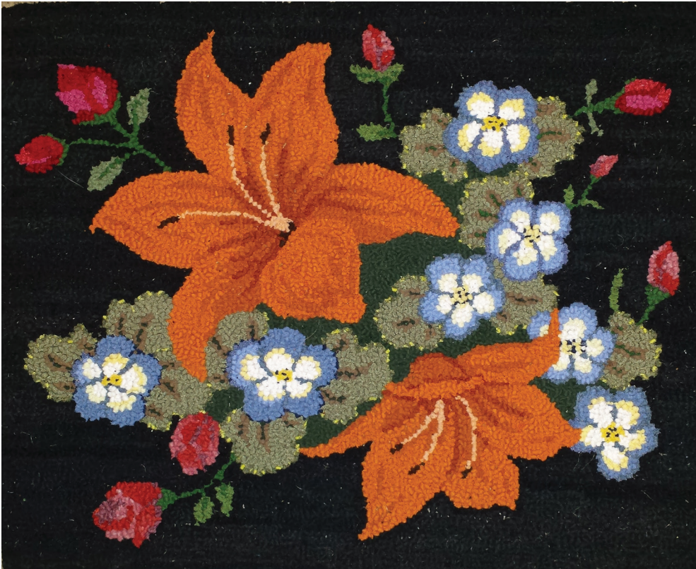
Ma Jolie Fleur , 16"x17" hooked with T-shirts