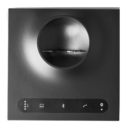
*LH670 & LH675 models only. Bluetooth Status lights up when your headset is on and is connected to a Bluetooth Device.