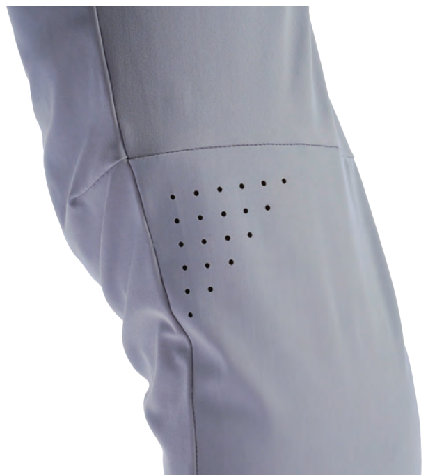
Laser-Vented Knee Bend

Designed as your go-to for versatility, these joggers effortlessly adapt from professional polish to casual ease, ensuring comfort and style for any part of your day.