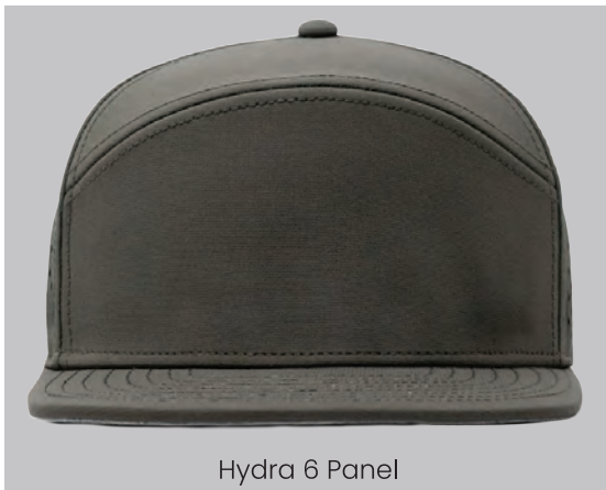
Hydra 6 Panel