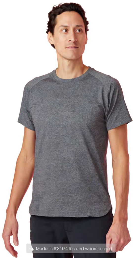
Model is 6'3" 174 lbs and wears a size L