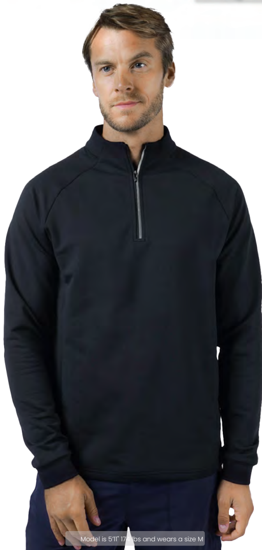
Model is 5'11" 175 lbs and wears a size M