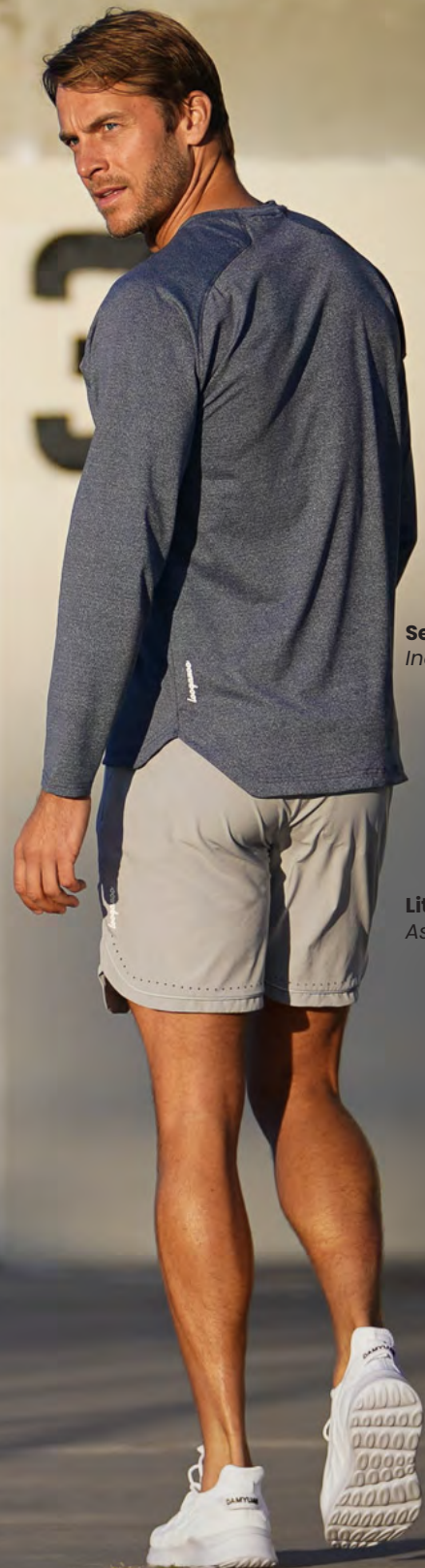
Seamfinity Long Sleeve Indago Navy