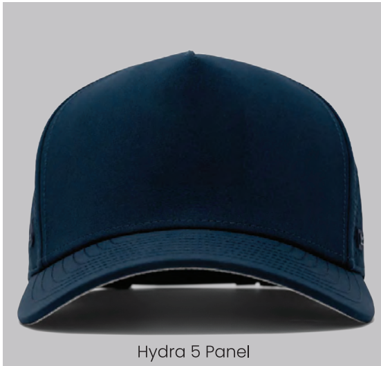
Hydra 5 Panel