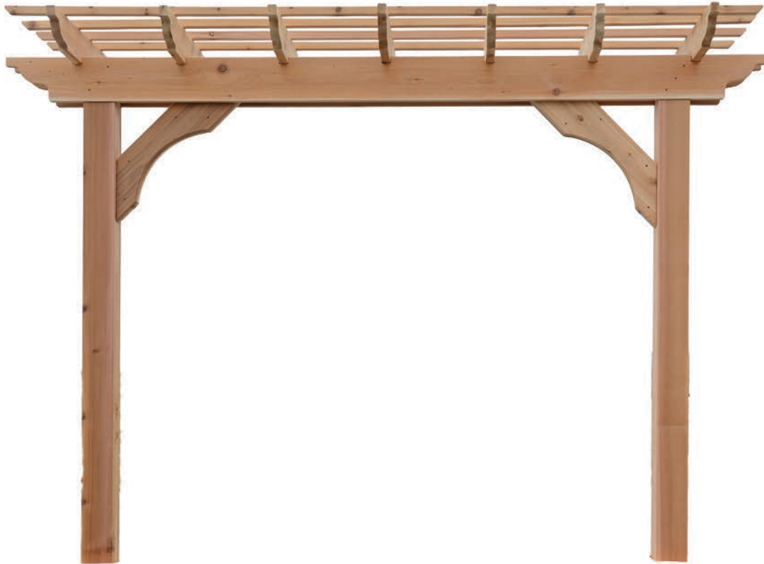
Pictured: 4 × 8 Cedar Inline Pergola