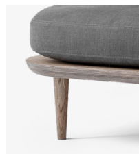
→ Smoked Oiled Oak w. Hot Madison 093