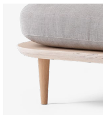
→ White Oiled Oak w. Hot Madison 094