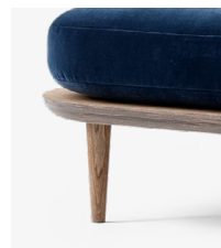
→ Smoked Oiled Oak w. Velvet 10 Twilight