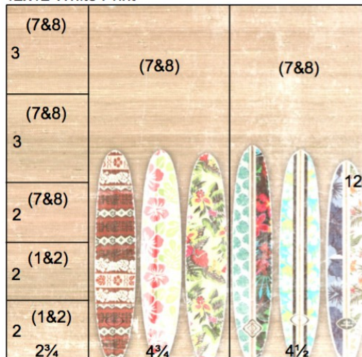
12x12 White Print

3. Place one 12x12 White Print right side up into the trimmer; cut at 7.5 and 2.75". Trim the 2.75x12 horizontally at 10, 8, 6 and 3".